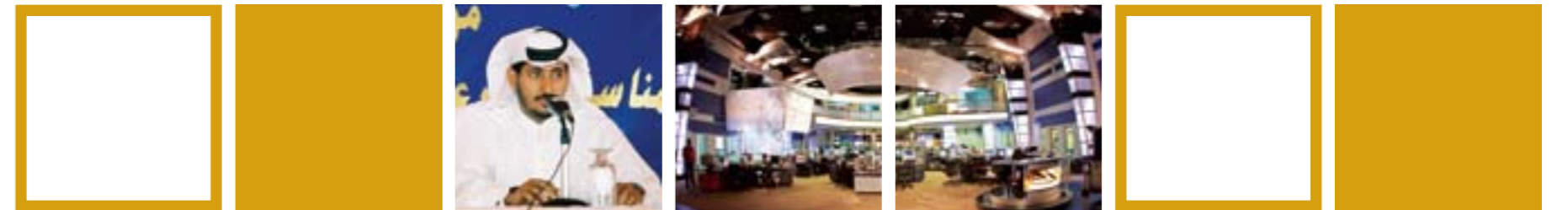
■ Chairman of the Board

Aljazeera Documentary managed to attract a huge number of Arab audiences interested in documentary films, but never had a channel that celebrated their identity and traditions.